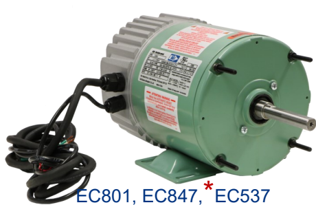
EC801, EC847, *EC537

See Video @ https://www.youtube.com/watch?v=QZ7qq18_i3U